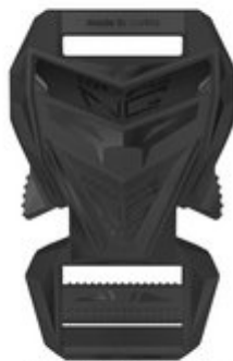
25 MM MALE AND FEMALE PART