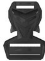
HYBRID – COMBINATION OF 45 MM MALE AND 25 MM FEMALE PART