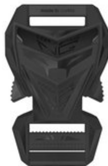
25 MM MALE AND FEMALE PART