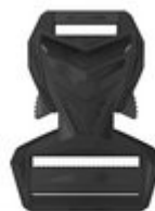
HYBRID – COMBINATION OF 45 MM MALE AND 25 MM FEMALE PART