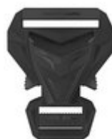
HYBRID – COMBINATION OF 25 MM MALE AND 45 MM FEMALE PART