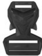
HYBRID – COMBINATION OF 45 MM MALE AND 25 MM FEMALE PART