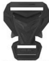
HYBRID – COMBINATION OF 25 MM MALE AND 45 MM FEMALE PART