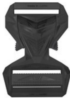
45 MM MALE AND FEMALE PART